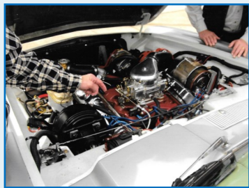
(Right) Carl Bowmer 1963 Studebaker Avanti R-2 Engine