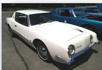
Maze & Linwood Melton's 1963 Studebaker Avanti R-2