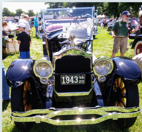
1920 Packard Twin Six