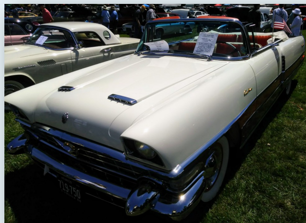
1956 Packard Caribbean