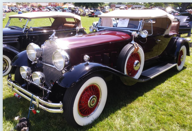
1930 Packard 745 Roadster