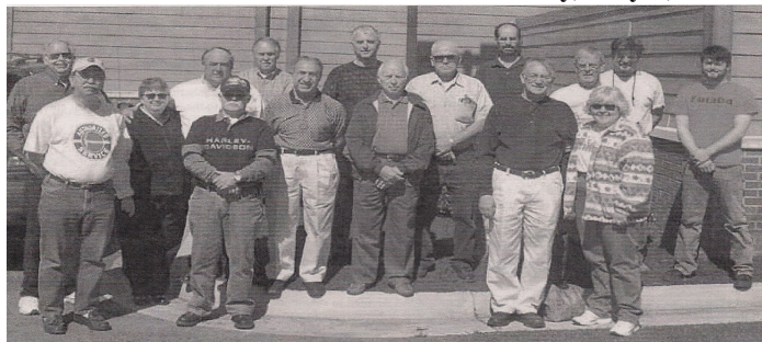
CVC Members gather at Famous Dave's Restaurant during the March Meet