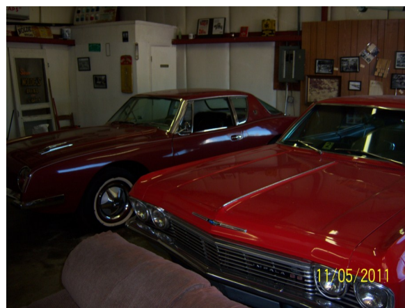
Darryl's 1963 Studebaker Avanti and 1965 Chevrolet Impala SS