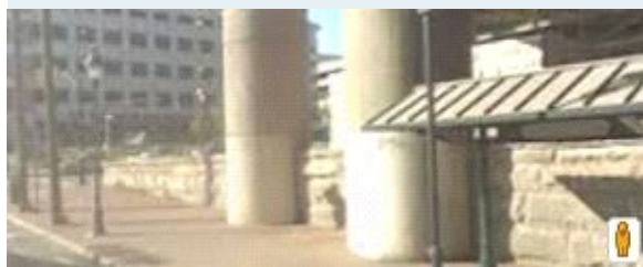
Site of H. M. Smith & Co main office 1532 East Main Street, Richmond, Virginia today

For more information go to http://www.vahistorical.org/ .