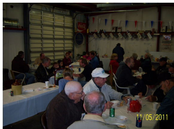
The group enjoying lunch