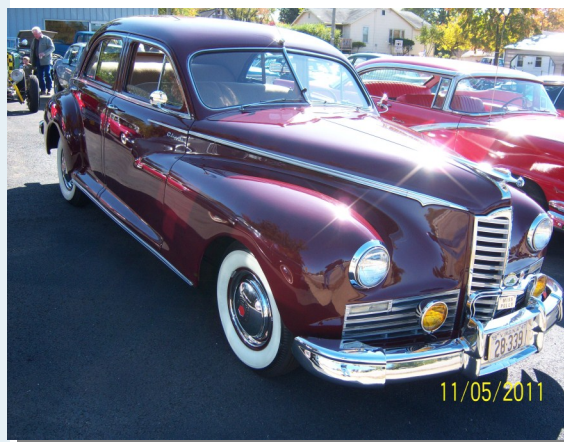
1947 Packard Clipper