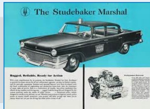
1958 Studebaker Marshal Police Car