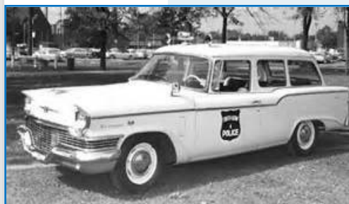
1957 Studebaker Parkview Police Car