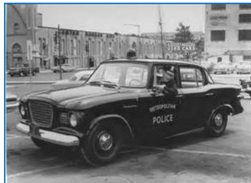
1960 Studebaker Police Car