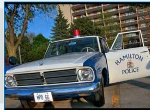
1966 Studebaker Police Car