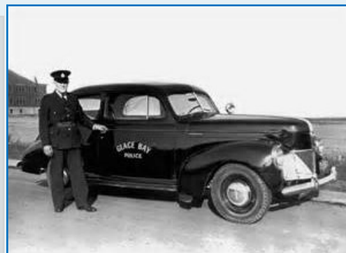
1940 Studebaker Champion Deluxe Club Sedan Police Car