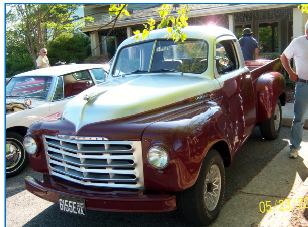
1953 Studebaker 2R 1/2 Ton, Hunter Sparagna