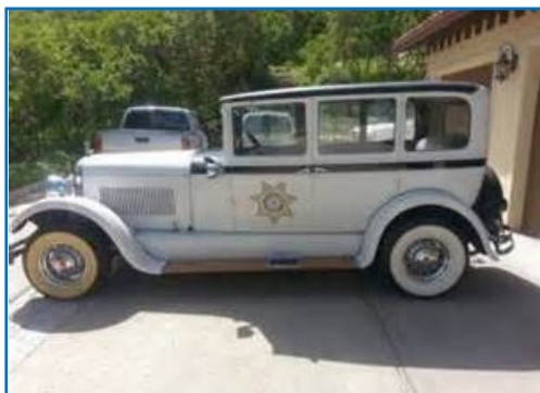
1927 Studebaker Commander Sheriff Package