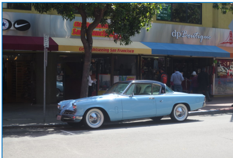
1954 Studebaker Commander Starliner