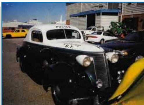
1937 Studebaker Police Car