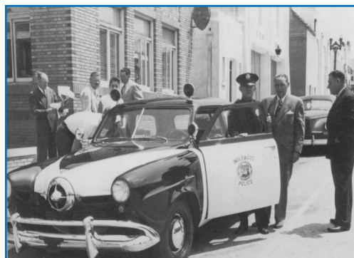
1950 Studebaker Police Car