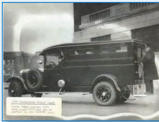
1918 Studebaker Police wagon

Here are some images of Studebaker Police cars offered though the years. .